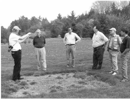
Tour of Secrest Arboretum