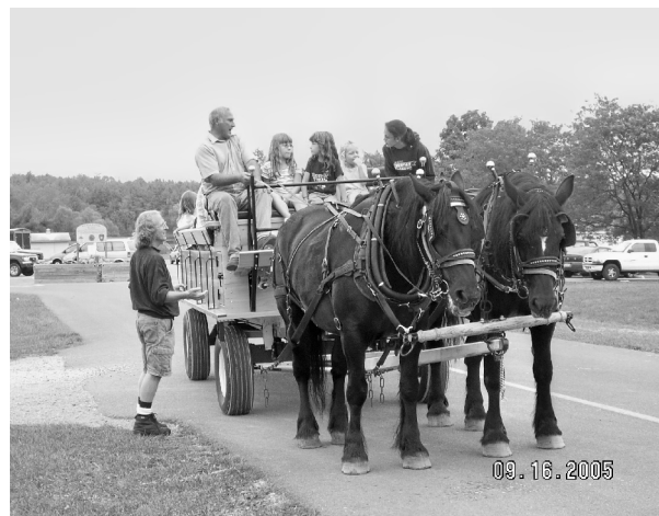
Horse Drawn Rides