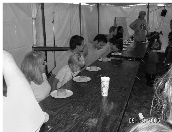
Pawpaw Eating Contest